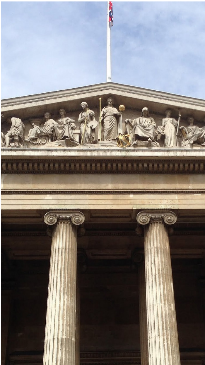
Photo: Museums are places that collect objects for different purposes.