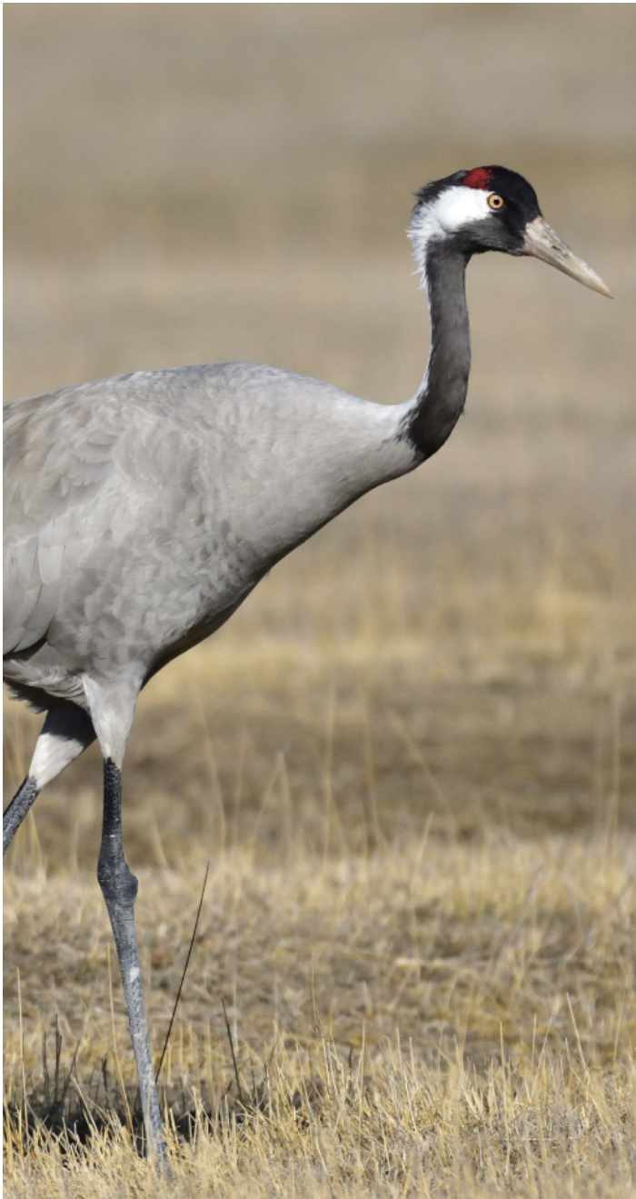
Photo: There were around 200 individual cranes in the UK in 2019.